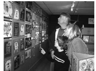
Families and individuals give grants to local organizations through donor-advised and area-of-interest funds. Bainbridge Arts and Crafts was awarded a BCF donor grant to help improve exhibition and sales space in 2005. Above, a family enjoys BAC's annual student art show in 2006.