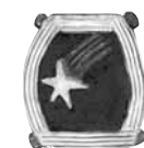
The Amy Award for Emerging Artists