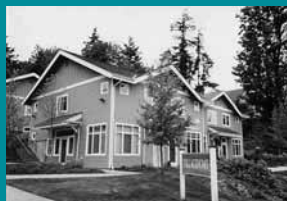
Village Home.

With nearly 24% of Bainbridge residents making less than $35,000 annually, affordable housing has become one of the community’s most critical issues. BCF granted funds to the Housing Resources Board for software upgrades, enabling HRB to more effectively manage an expanding property and client base.