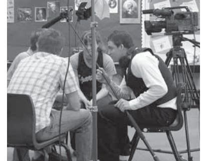
Bainbridge High School students at work with BITV through the B.I. Arts Education Community Consortium. BITV has received funds from BCF to further their community role.

We focus on helping our donors fulfill philanthropic interests by supporting organizations within our island community. Our goal is to raise funds through significant gifts from donors and to make grants from these funds to support the long-term needs of Bainbridge Island.