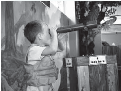
Exploring at KiDiMu.